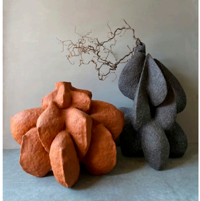
From left: Flux lamp by Jan Ernst; Mama and High Neolithic vases by Voznicki

Architect-turned-ceramicist Jan Ernst 's intriguing designs emerge from the natural world around Cape Town, South Africa, resulting in a symbiosis of emotion and function. The forms he imagines are abstract interpretations of what he feels when in contact with nature – always transforming them into functional items. For his latest collection Flux , which features a set of table lamps and a table mirror specially designed for Mia Karlova Galerie, Jan takes cues from the transformative nature of copepods.