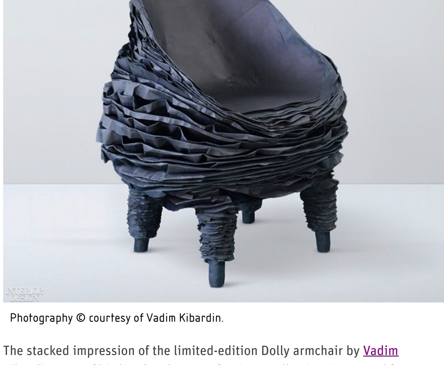
Photography © courtesy of Vadim Kibardin.

The stacked impression of the limited-edition Dolly armchair by Vadim Kibardin , part of his handmade Paper furniture collection, is created from a combination of recycled cardboard and black paper. Via Mia Karlova Galerie .