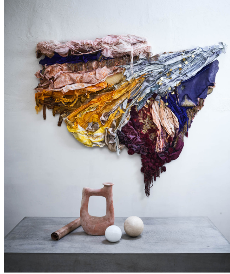
Conflicting Forces textile wall piece by Femke van Gemert © Mia Karlova Galerie 2022.