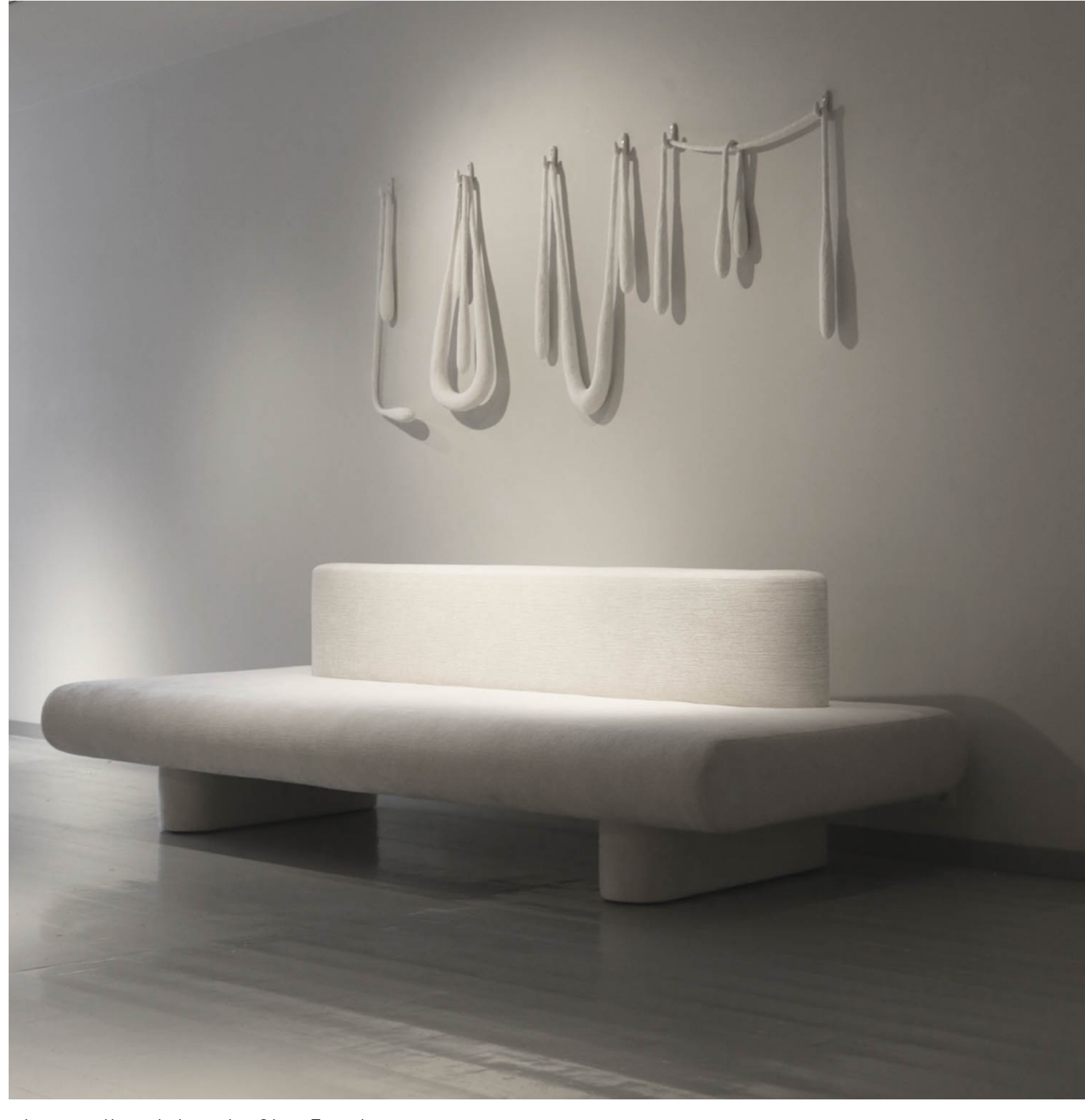
Love wall sculpture by Olga Engel.