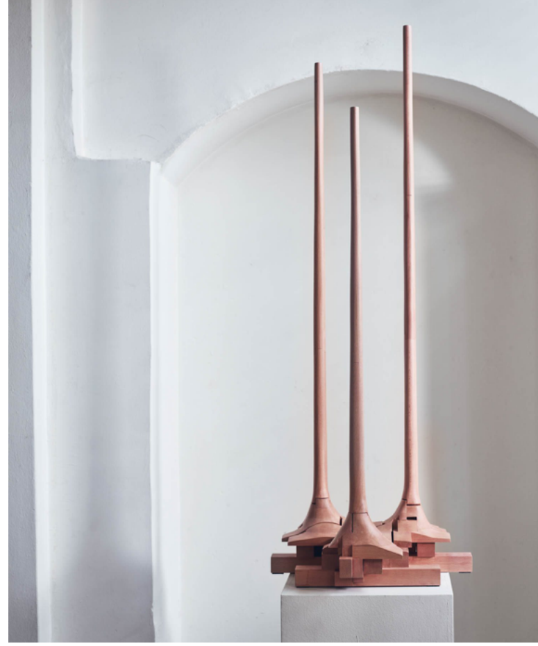
The Surfaced coat rack by Design Academy Eindhoven graduate Sho Ofa.